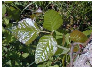
Poison Ivy in the spring (picture taken in mid-April in USDA zone 7a-7b). Notice that the young leaves are red and as they mature they turn their summer color of green. Characteristic 3 leaves with the middle leaf on a longer stalk.