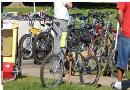
Buy/Sell/Trade Bikes and Parts