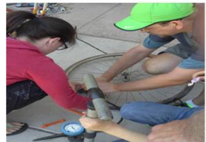
DEMOS and FLAT TIRE CHANGING CLINIC.