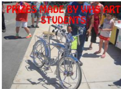
Ride/Show Off Your Bikes Check Out/ Vote for Some Cool Rides