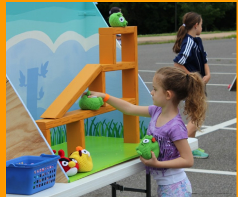
New Angry Birds Game

We debuted a few new things at this year's fest - the Angry Birds game and the photo booth - they were a big hit!