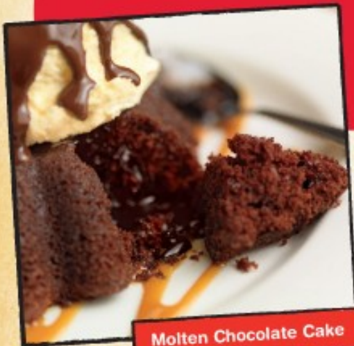
Molten Chocolate Cake