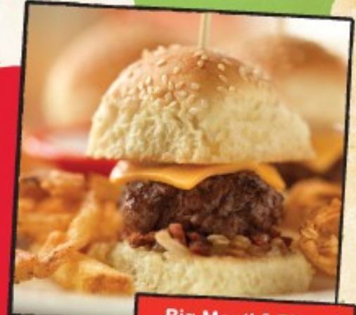
Big Mouth® Bites

We look forward to seeing you here. Pepper in Some Fun!