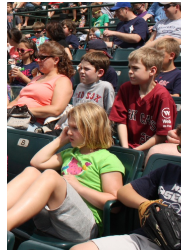
Fun was had by all at the Rock Cats game!