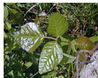
Poison Ivy in the spring (picture taken in mid-April in USDA zone 7a-7b). Notice that the young leaves are red and as they mature they turn their summer color of green. Characteristic 3 leaves with the middle leaf on a longer stalk.