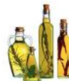
Artisan Olive Oils

Date: Thursday, November 20 th Time: 5:30 PM – 8:00 PM Location: 461 Welles Road, Wethersfield, CT Holiday Store: Gymnasium Vendor Fair: Cafeteria