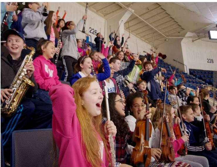
EW Tigers at the Wolfpack Game! Now watch me whip! Watch me nae nae!