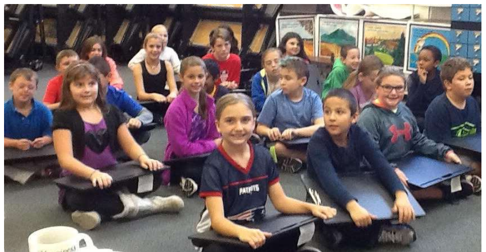
EW Tigers enjoying their NEW Lap Desks!